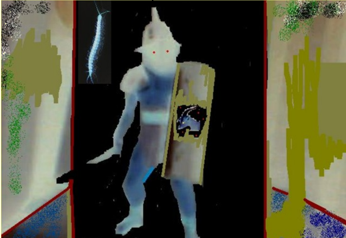
Demons in armour

And some say demons are unprogressed spirits Whose horns are bones twisted by remorse